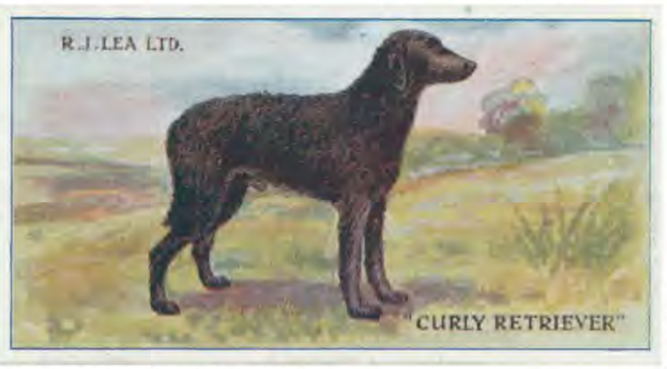
Curly-Coated Retriever: cigarette card, early 20th century

This reminded me of a game I teach puppies in preparation for the scent discrimination exercise they will later learn in Utility, and for other scenting activities such as tracking. Curlies are